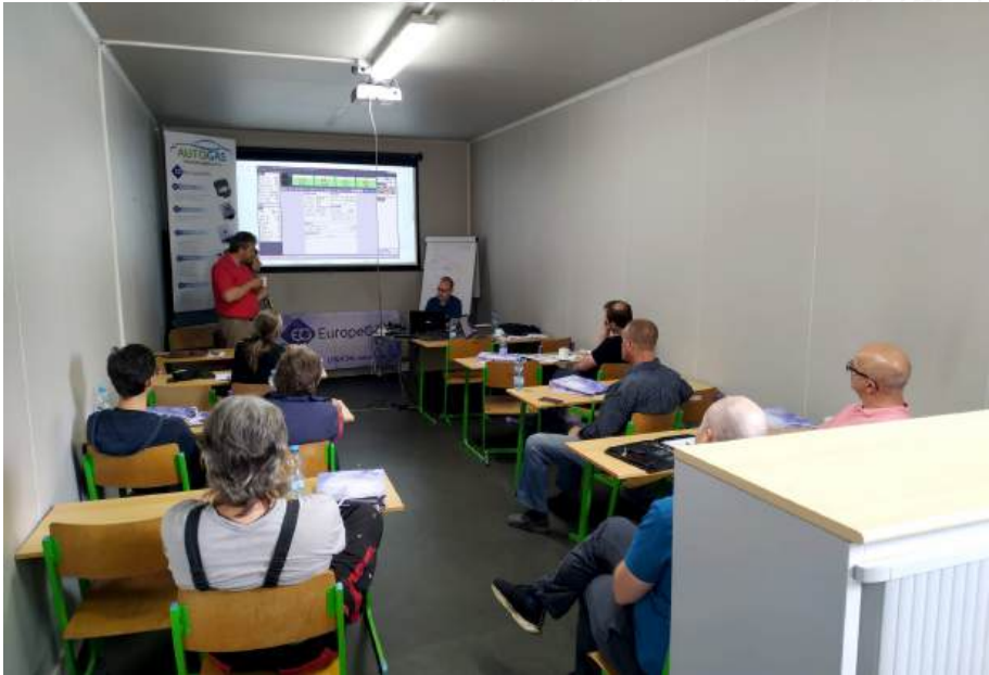
EG Injecto 48 software training.

Each EuropeGAS product is designed for the users, that is why our main factors are easiness and intuitiveness of service. Through direct meetings with our clients we are able to familiarize with product feedback, and share the experiences regarding everyday usage of our equipment.